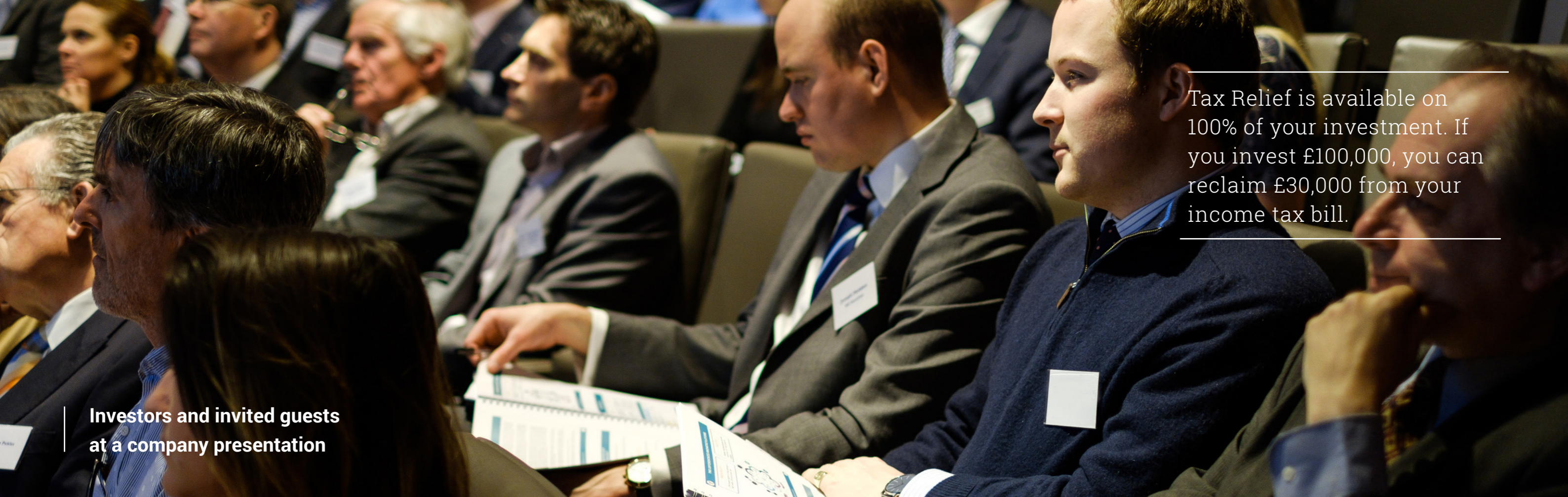
Investors and invited guests at a company presentation

Tax Relief is available on 100% of your investment. If you invest £100,000, you can reclaim £30,000 from your income tax bill.